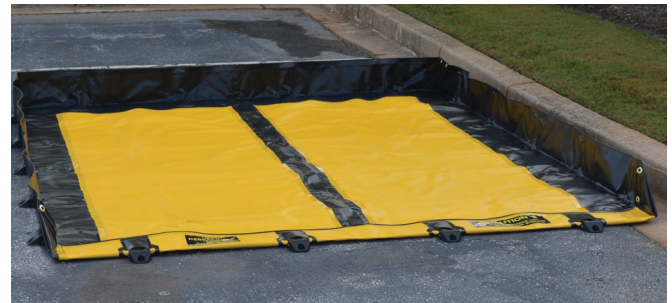
Rigid-Lock QuickBerm All-in-One