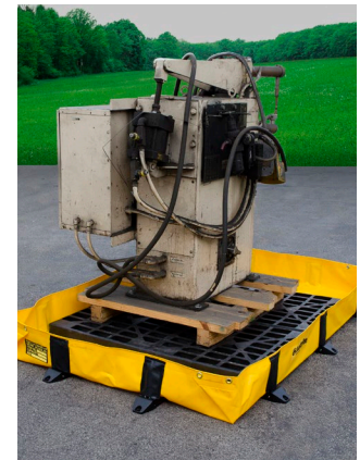
Rigid-Lock QuickBerm Lite